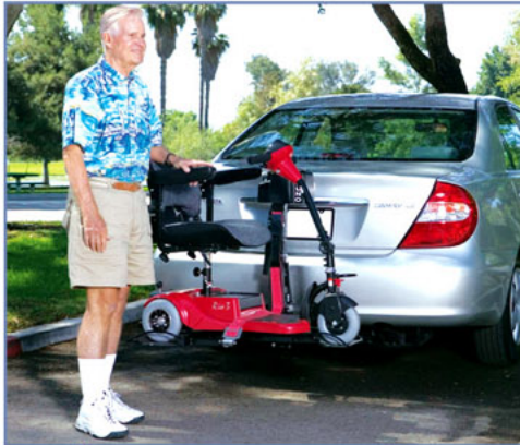
OUT-SIDER™ MICRO LIFT ASL-225