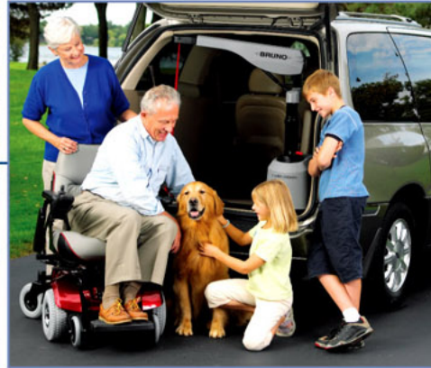
NEW CURB-SIDER™ VEHICLE LIFT VSL-672