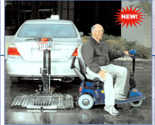
OUT-SIDER™ MERIDIAN™ LIFT ASL-250