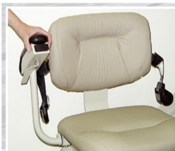
The seat arms flip up and out of the way for easy wheelchair transfers. The swivel seat lever is conveniently located under the arm.