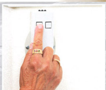
The two, wireless call/send controls make installation simple and clean with no wires running along the wall.