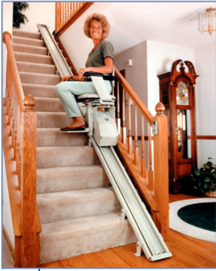
ELECTRA-RIDE II™ Model SRE-1550