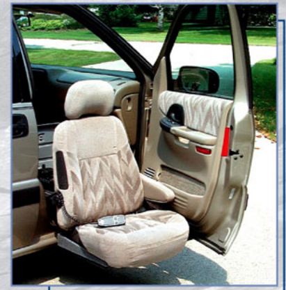
TURNY™ V (HD) SEAT

Revolutionary Turning Automotive Seating™ (TAS™)