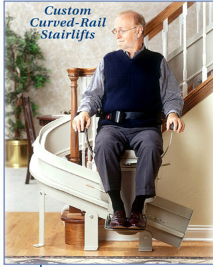
ELECTRA-RIDE III™ Model CRE-2100